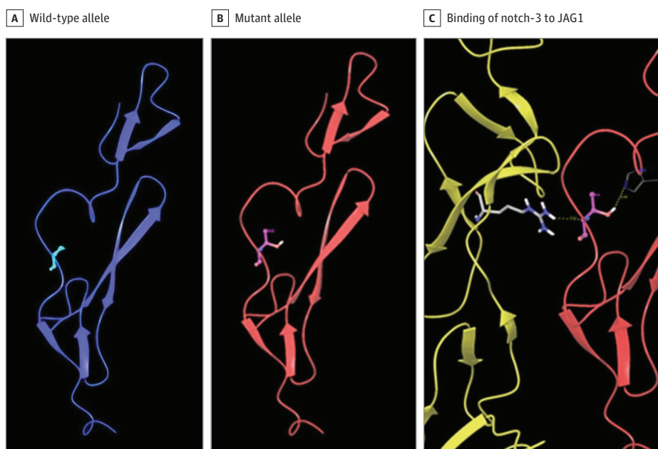
Figure 1. Notch-3 Protein Model Highlighting Position of the Alzheimer Disease–Associated Single-Nucleotide Polymorphism rs149307620 (p.A284T)

Predicted model for wild-type allele with alanine at mutation site (A), mutant allele with threonine at mutation site (B), and binding of notch-3 (red) to JAG1 ligand (yellow) (C). Possible hydrogen bonding that would likely cause greater interaction with the ligand is displayed.