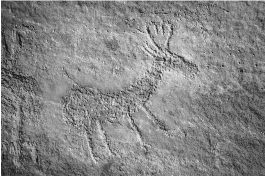
Fig. 2. Rock art found in GSENM has contributed to knowledge of the cultures of early Native Americans who inhabited the region.

Presnall (1938) conducted a survey of the mammals in Zion National Park, Bryce Canyon National Park, and the Cedar Breaks areas surrounding the Monument. Durrant (1952) surveyed throughout the state for mammalian occurrence, but relied heavily on Tanner's (1940) small mammal work for the Kaiparowits Plateau and Paria River basin. Pritchett (1962) collected mammals throughout Kane County. Raines (1976), Atwood and Pritchett (1974), and Murdock et al. (1974) studied the fauna of all the Kaiparowits region. However, their collection sites were located primarily on the east side of the Colorado River, and only 3 were located in GSENM. Hayward, Killpack, Coffery, and Pritchett (unpublished data) kept mammalian population records in the area of the Monument between 1952 and 1960 as well. More recently, surveys have been conducted for chiropteran species by the BLM in the summers of 1997 and 1998. In the following sections describing species in GSENM, records of occurrence for each species are listed as Specimens Examined for museum records of specimens, and Additional Records for occurrences cited in the above literature. Where no