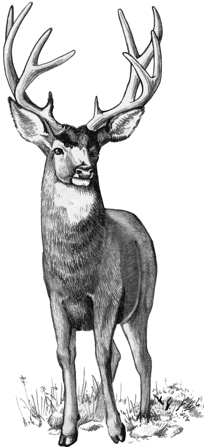
Fig. 4. The mule deer is distributed throughout GSENM. Both antler size and body size determine a male's breeding status.