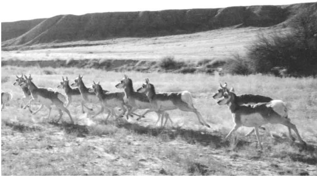
Fig. 3. The pronghorn, found throughout western Utah, forms herds and inhabits grassland and semidesert shrublands.

et al. 1994). Several different forms of communication, from hairs on rump that can be erected for alerting others of potential danger and postural movements to vocalizations for threats, rutting, fawn communication, and forewarning of danger (O'Gara 1978).